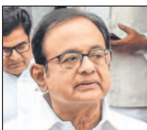
● P Chidambaram

HT Correspondent ● letters@hindustantimes.com