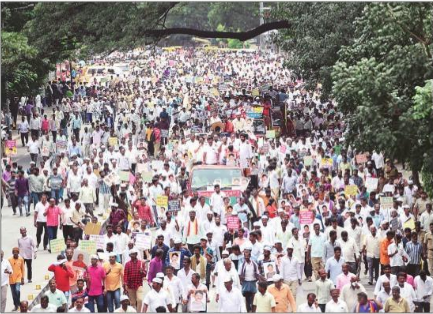
Vokkaliga community members at a rally in Bengaluru on Wednesday.

The Supreme Court, he pointed out, had said in the judgment that "sunlight is the best disinfectant. Live-streaming as an extension of the principle of open courts will ensure that the interface between a court hearing with virtual reality will result in the dissemination of information in the widest possible sense, imparting transparency and accountability to the judicial process."