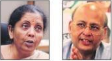
Nirmala Sitharaman and Abhishek Singhvi